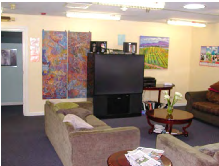
Helen Vine Sitting Room (March 2006)

A 2002 Marin County Civil Grand Jury report states, "The present location and condition of the Helen Vine Detox Center is vastly inadequate and inappropriate for a facility devoted to recovery from alcohol and substance abuse. It may even be unsafe."