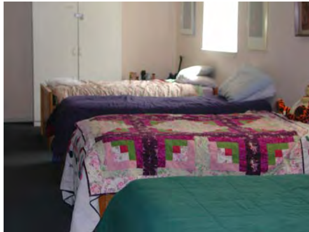
Helen Vine Women's Dorm (March 2006)

In December 2002, Community Action Marin, with County encouragement and cooperation, took the initiative in a fund-raising effort to renovate the 4,800 square foot Silveira jail building. The necessary funds were raised, and the new Helen Vine Detox Center opened in September 2003. Since July 1, 2005, the center has been run by the Lawyers for One America (LFOA), a non-profit organization.